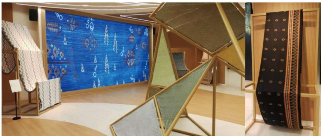
Indonesian Cultural Heritage "Wastra Nusantara"

By promoting community-based industries, the Indonesia Pavilion supports Indonesia's creative economy, while aligning to two of the Sustainable Development Goals (SDGs), particularly Goal 8: Decent Work and Economic Growth and Goal 12: Responsible Consumption and Production. This