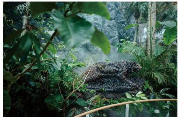
Fauna Installation — Sumatran Tiger (2024) by Nyoman Nuarta, on display in Nature area of the Indonesia Pavilion

to global sustainability and resilience. At the heart of this experience is the Nature section, where visitors are transported into the lungs of the Earth — Indonesia's vast tropical rainforests. As the world's third-largest tropical rainforest area, following Brazil and the Democratic Republic of the