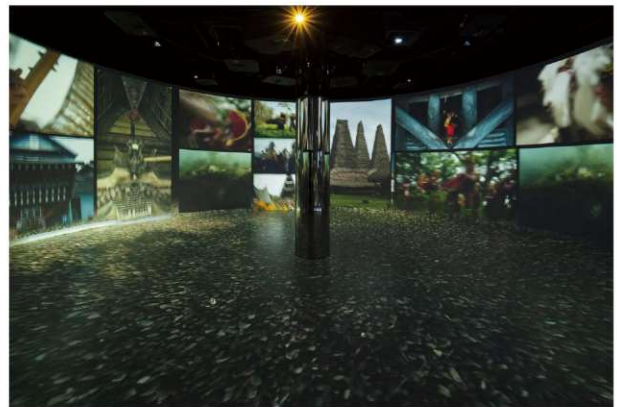
A 360° Journey Through Indonesia: From the Depths of the Earth to the Skies — Immersive Room at the Indonesia Pavilion

The Immersive 360° Experience at the Indonesia Pavilion offers visitors more than just a visual journey — it invites them to feel part of Indonesia's living story. Through dynamic, engaging visuals, the experience captures the soul of the archipelago, revealing a nation of extraordinary diversity that stretches across over 17,000 islands, home to 1,300 ethnic groups and 718 languages. It is a tapestry woven from rich natural landscapes and vibrant cultural expressions, presented not only as scenic beauty but as the heartbeat of Indonesia.