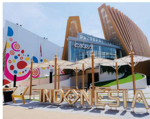
Indonesia Pavilion's Boat-Inspired Design Celebrates Its Archipelagic Spirit