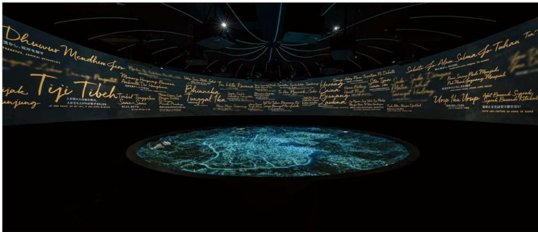
Indonesia Pavilion's Showcase on Aspiration for Future Cities

Congo, Indonesia's forests span over 90 million hectares. Beyond their stunning beauty, these forests serve as one of the planet's most critical carbon sinks, absorbing significant greenhouse gas emissions and playing a pivotal role in maintaining global climate stability.