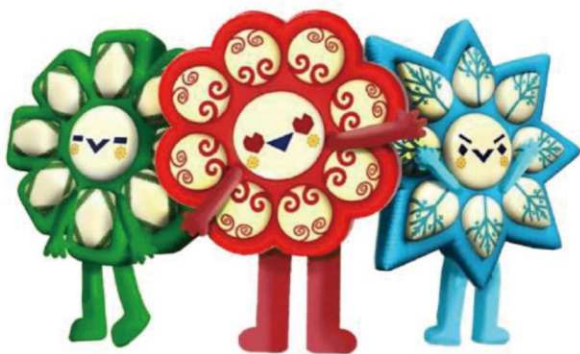
TumTum, the Pavilion's mascot

Through the theme of "Thriving in Harmony: Nature, Culture, and Future", the Indonesia Pavilion invites visitors on an immersive journey through Indonesia's vast natural and cultural landscapes. Supporting this narrative throughout the Pavilion is TumTum, the Pavilion's mascot, whose design is inspired by the Truntum Batik motif. TumTum symbolizes everlasting care, guidance, and Indonesia's belief in nurturing harmony between people, planet, and progress. This section sends a powerful reminder that the protection of these vital ecosystems is not just an Indonesian responsibility, but a global imperative to ensure the well-being of our planet for generations to come.