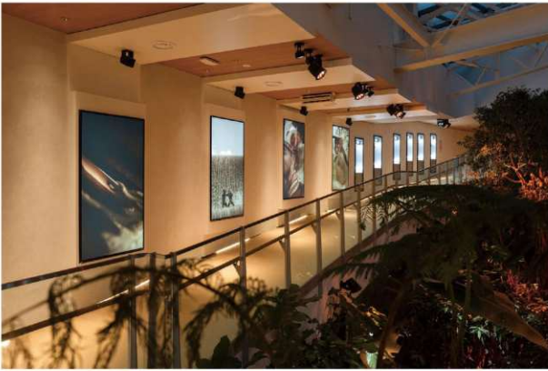
Gallery of Traditional Weaponry, Martial Arts, and Blacksmithing at the Indonesia Pavilion

The journey carries visitors through majestic volcanoes, lush rainforests, colorful villages, and coral-rich oceans, showcasing Indonesia's critical role as a global guardian of biodiversity and climate resilience. As home to 76% of the world's coral species, 17% of global mangrove carbon reserves, and the world's second-longest coastline, Indonesia stands at the frontline of protecting vital ecosystems that sustain the planet's future.