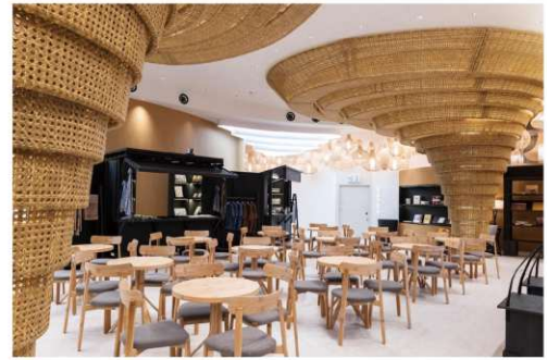
Indonesia Pavilion Restaurant: A Showcase of Sustainable Design and Local Craftsmanship