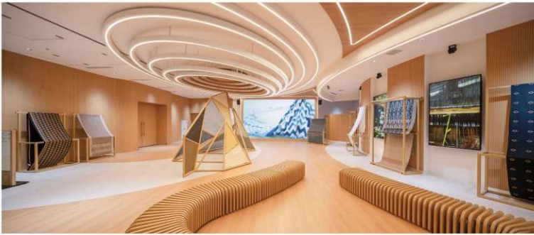
Indonesia Pavilion's Wastra Area: Celebrating Traditional Textiles from Across the Archipelago